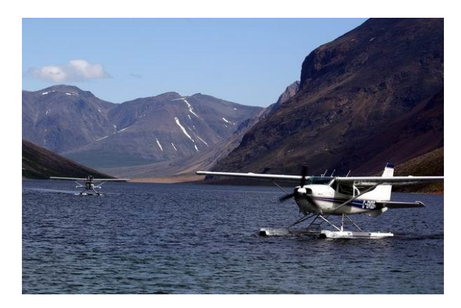
You'll alternate between safari by floatplane and safari on foot to watch the wildlife of Nunavik against a variety of stunning backdrops.

Rapid Lake Lodge is situated in Arctic Quebec in the heart of the sub-arctic tundra, 1,400 km from Montreal and 150 km southeast of Kuujjuaq. Rapid Lake Lodge is charming and cosy, constructed completely by hand with round timber. All lodgings are equipped with modern conveniences and provide daily maid service. Departing from Rapid Lake, you'll fly out every day to experience the regional natural wonders and arctic wilderness.