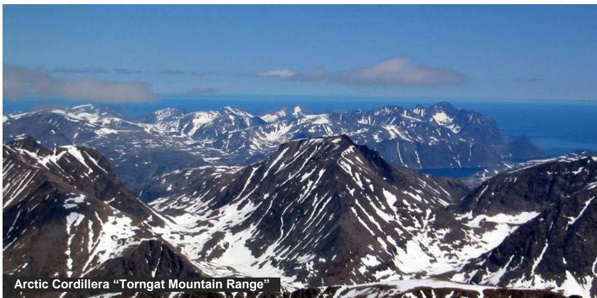
Arctic Cordillera "Torngat Mountain Range"