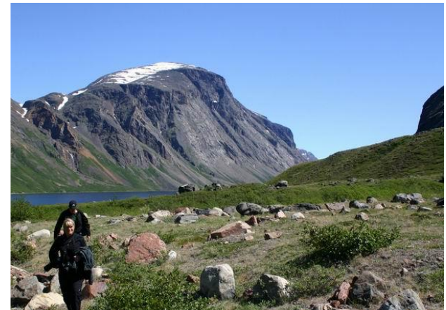
A tour of the fjords is not to be missed.

Rapid Lake Lodge is situated in Arctic Quebec in the heart of the sub-arctic tundra, 1,400 km from Montreal and 150 km southeast of Kuujuaq. Rapid Lake Lodge is charming and cosy, constructed completely by hand with round timber. All lodgings are equipped with modern conveniences and provide daily maid service. Departing from Rapid Lake, you'll fly out every day to experience the regional natural wonders and arctic wilderness.