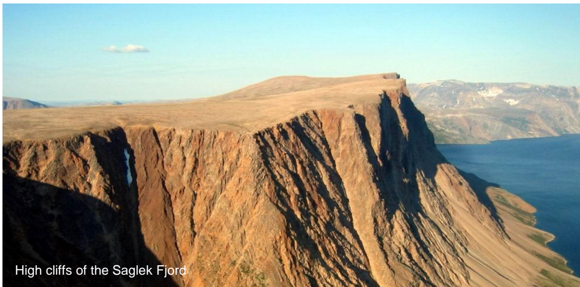
High cliffs of the Saglek Fjord