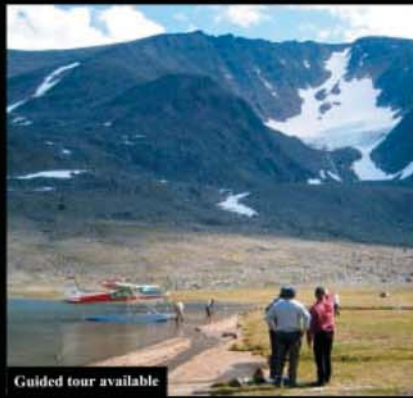
Guided tour available

Day 2+3 You have many options for exploring the grandeur of the Torngat Mountains. The Land's End air route is unique for seeing gigantic icebergs and polar bears, while the Kaumajet and Torngat Mtn scenic air routes have some phenomenal fjords and canyons vistas that are waiting to impress you.