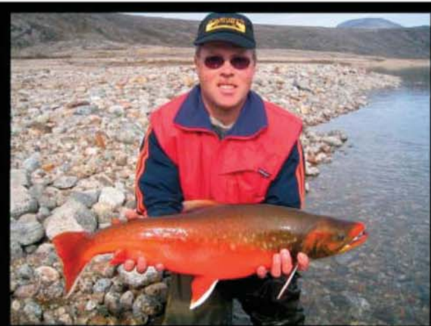
Our coastal rivers provide a path for huge runs of migrating Arctic char.

Day 3+4 Fly from the Ungava Bay to the Labrador coast taking in sights along the way including the ghost town of Hebron. You'll spend most of the day enjoying the splendor of the Tomgat Mountains.