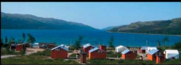
The Barnoin River camp

Most seaplane and wheelplane pilots come to Arctic