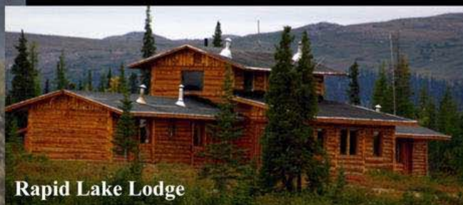
Rapid Lake Lodge

For an extra dash of excitement try fishing for trout and char. Walk through pristine wilderness with views of the entire Tree Line Range and meteorite Crater lake. Be on the look out for roaming Caribou.