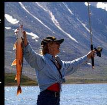
Fish for Arctic Char