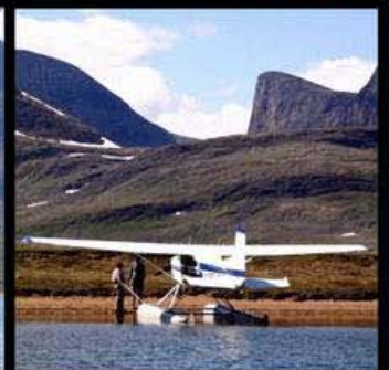
Relax on a secluded beach