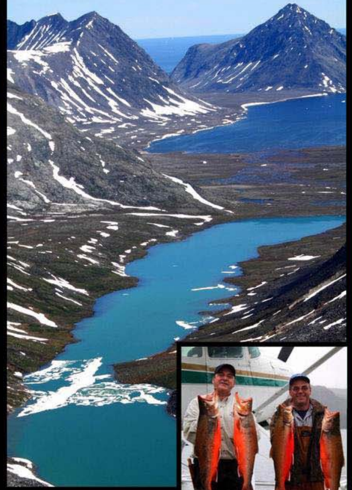
Hike or camp in Adams Lake