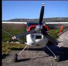
Land at Barnoin Camp

Spend a week experiencing a land beyond the reach of all roads.