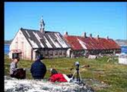
Visit Hebron Ghost Town

Our three exceptional Scenic Air Routes capture the diversity of the Arctic wildlife and nature geologic wonders. Along the routes you'll see Polar bears, Caribous, Seals, Whales and many impressive birds colonies. You can also observe some gigantic Icebergs, walk to an ice aged Glacier and explore some towering Waterfalls. Take a day to visit Hebron Ghost Town and find more about the German missionaries and the mystery that wiped out the town.