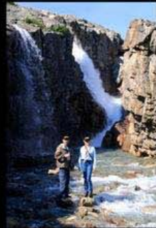
Hike to many spectacular falls