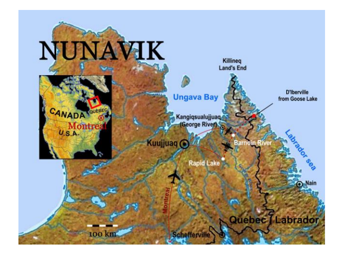
The camp at Barnoin River is situated in Arctic Quebec, 1,500 km north of Montreal and 165 km East of Kuujjuaq. The Mount D'Iberville is located less than 120 km East of Barnoin camp.

Day 3 to 8: Climb Mount Iberville and Explore Ramah Bay.