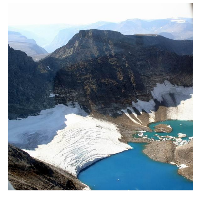
Iceblue Tarn below Minaret Spur of Mount D'Iberville.

Further detailed tax info is available in the rates section.