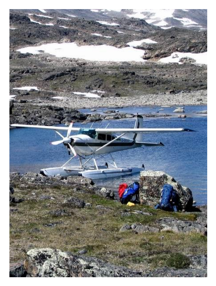
Located at 400 meters altitude and less than 8 km from the summit, Goose Lake is the ideal landing site for access to Mount D'Iberville's summit.

Our objective is to facilitate your familiarity with the most spectacular spots, providing you with the maximum amount of information possible about a given area. Use the proposed itinerary as inspiration for planning a do-it-yourself trip. Nevertheless, it's up to you to design your tour itinerary and prepare your gear, based on your preferences, budget, level of comfort and fitness. We will not add you to an existing group. Bushland flights are often subject to last-minute change depending on weather conditions, in which case arrival and departure dates to and from Barnoin Camp as well as landing sites will be adapted to the best possible alternative. The list price for this trip is based on double occupancy. 2.5% discount for payment by check.