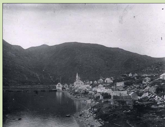
Okak, Labrador 1919

http://www3.nfb.ca/collection/films/fiche/medias.php?id=16164