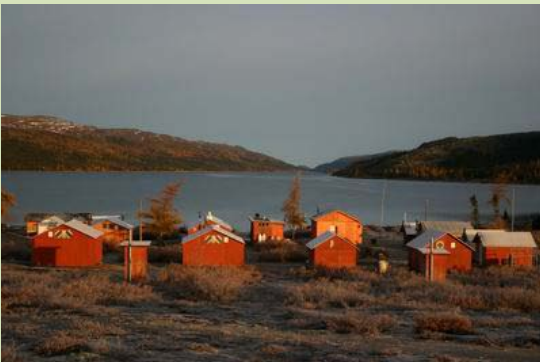
Barnoin River camp N-58° 33' W-065° 27' Comm.: MF 126.7 5 NM 3900 ASL