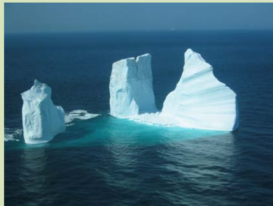
Quarter mile size iceberg.

zoom on a polar bear, or when you focus on a caribou herd standing on a snow-bank. Also make sure your camera has good batteries.