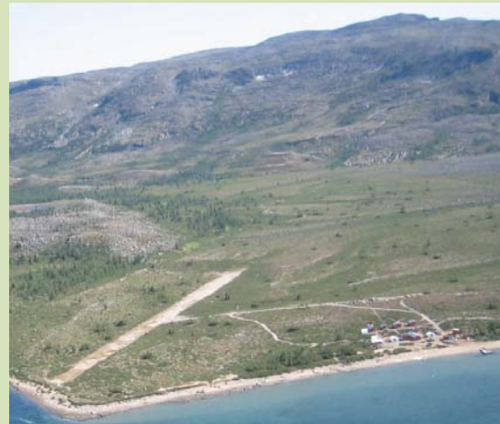
Barnoin River is a 1275 feet runway. N-58° 33' W-065° 27'

The Barnoin River Camp bush runway's is in fairly good condition. When using the runway you are fully responsible of the incidents and consequences that may occur.