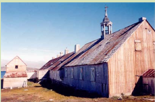
Hebron Ghost Town Labrador.

★★★★★ N-58° 12', W-062° 38' The Spanish influenza appeared at the Inuit village of Hebron in October 1918 after a supply ship arrived there from St. John's with an infected crewmember on board. By November 19th, 86 of Hebron's 100 residents had died from the influenza. A further 74 people died in surrounding communities, cutting the area's population to 70 from 220. Flying over Hebron's mysterious "Ghost Town", you can observe a cemetery and the church's massive hardwood frame, brought all the way from Germany. The ghost town is a real magnet for aerial tourists, although architectural details of the 175-year-old settlement are lost from the sky.