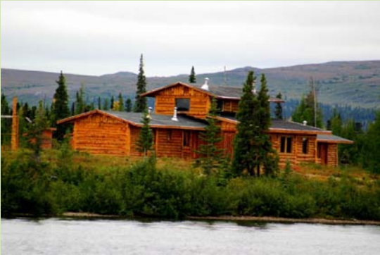
Rapid Lake Lodge N-57° 19' W-065° 56' Comm.: MF 126.7 5 NM 3900 ASL

Schefferville is your last fuel stop before the next 152 –mile leg to Rapid Lake/ 228- mile to Barnoin. Take note: In Schefferville airport the delivery hours are Monday to Friday 8:00AM to 5:00 PM. The Squaw Lake float plane bases are open 7 days a week from 8:00 Am to 7:00 PM. Calling ahead of time is always recommended.