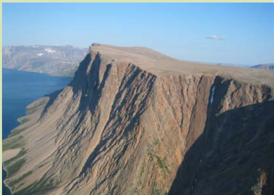
Saglek West Arm is a 3,000 feet sheer wall.