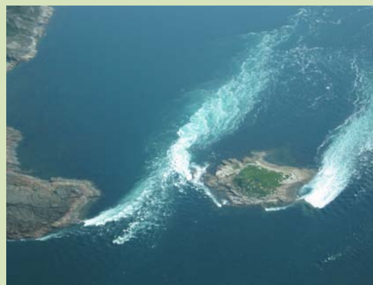
Boudan reversing fall is nature pure raw power generated by the Ungava tide.

The Ungava Bay has the second highest tides in the world. The tide has a peak range of 52 feet. Twice a day, you can observe the Boudan waterfalls flowing in two opposite directions.